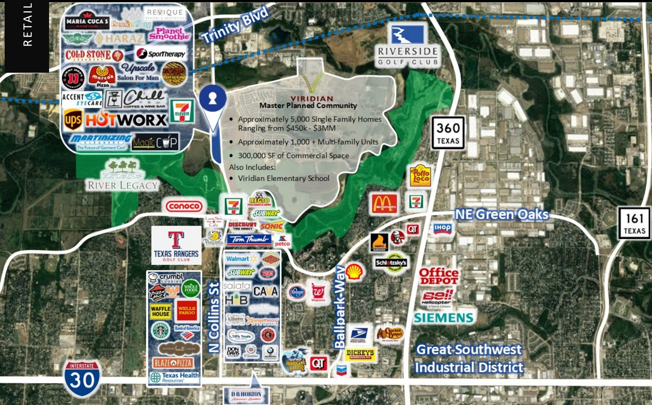
The Viridian in Arlington ranked one of the Wealthiest zip codes in North Texas