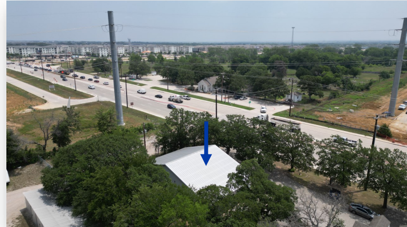
Northeast View—Century Apartment Complex & Hwy 380