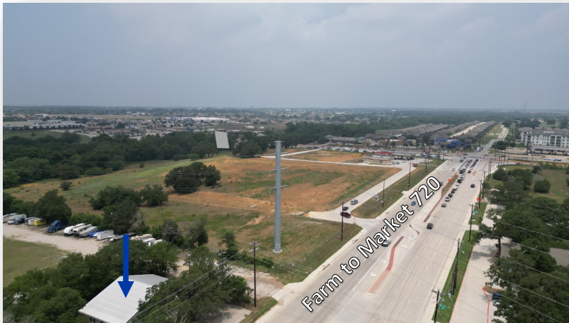
Northwest View—Shopping Center & Hwy 380