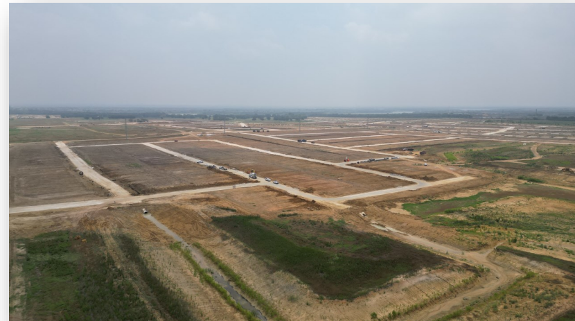
Developing subdivision across the street Spiritas Ranch Project—2100 homes (click link for article)