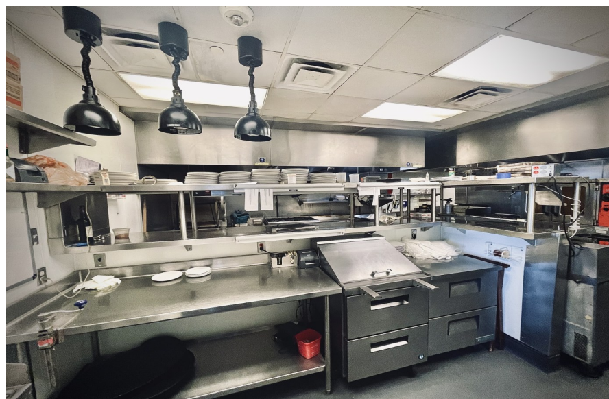
Commercial Prep Station, Alternate Angle