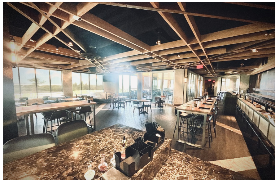
Bar-side High Top Patio View