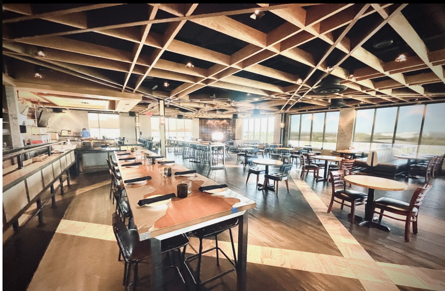
Bar-side Fine Dining High Tops