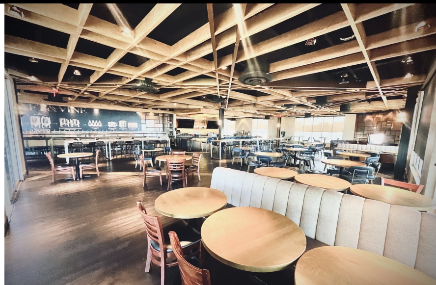
Sunset-view Booth Seating