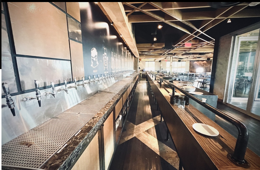
Elegant Bar with Beer or Wine Taps