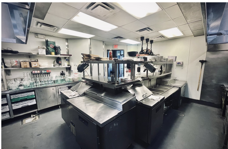
Commercial Kitchen Prep Station