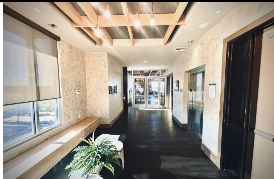
Temperate, Dedicated Main Lobby Waiting Area