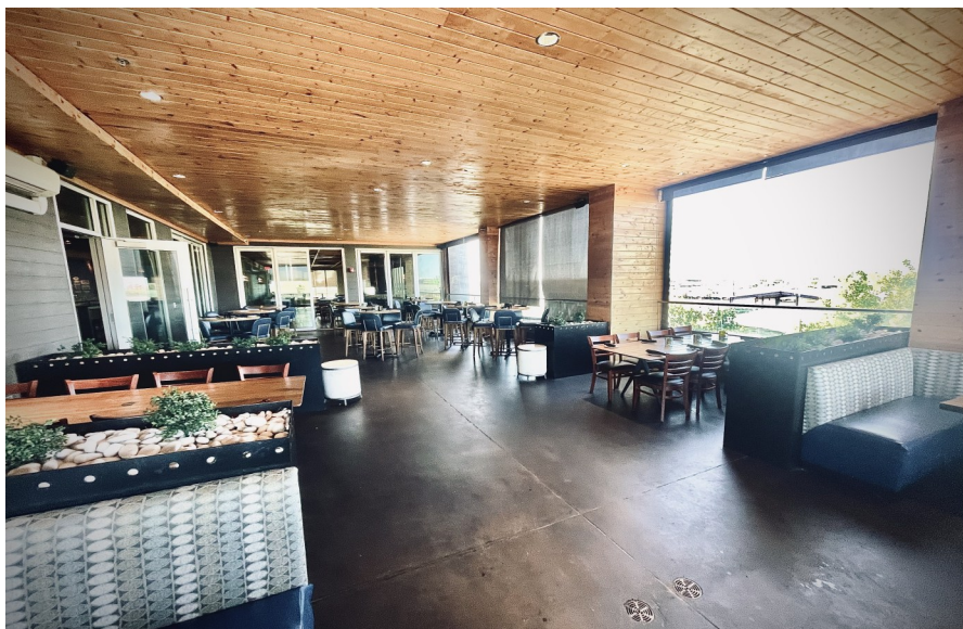
Heated and Cooled Scenic-view Patio