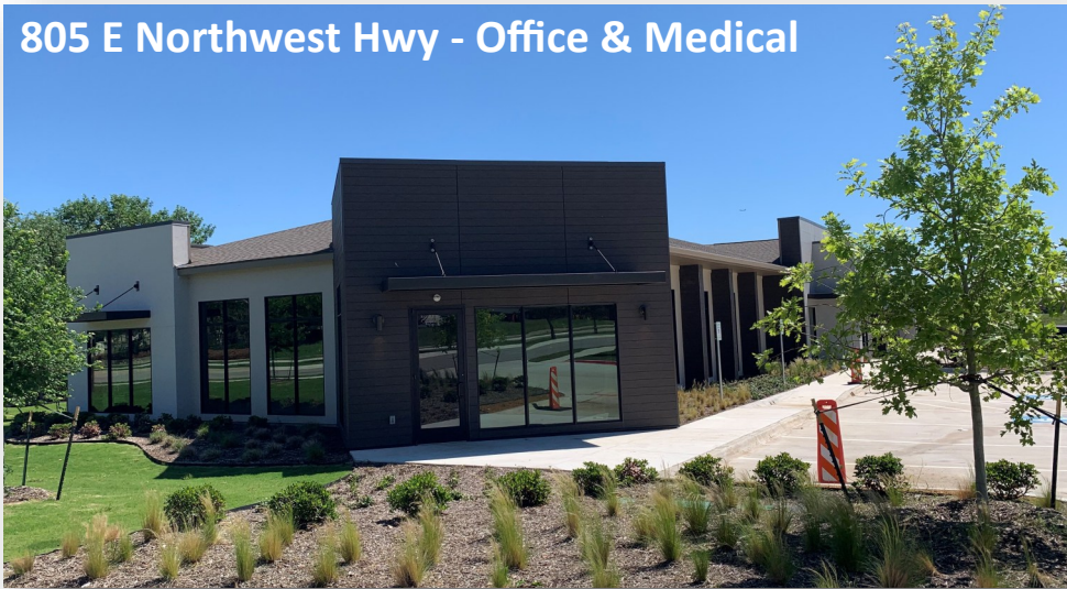
805 E Northwest Hwy - Office & Medical